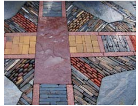
above: paving detail of triangular 'stonender' on pages 36-37