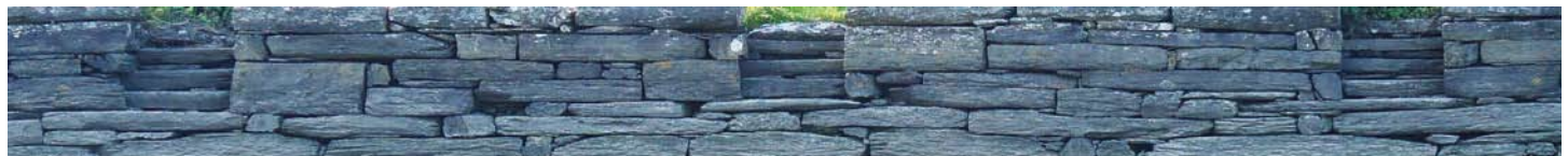
below: Tyddyn Isa Quay on the Afon (river) Dwyrhyd.

stone (ston) n. 1. a. Concreted earthy or mineral matter; rock. b. Such concreted matter of a particular type. Often used in combination. 2. A small piece of rock. 3. Rock or piece of rock shaped or finished for a particular purpose, especially a piece of rock that is used in construction.