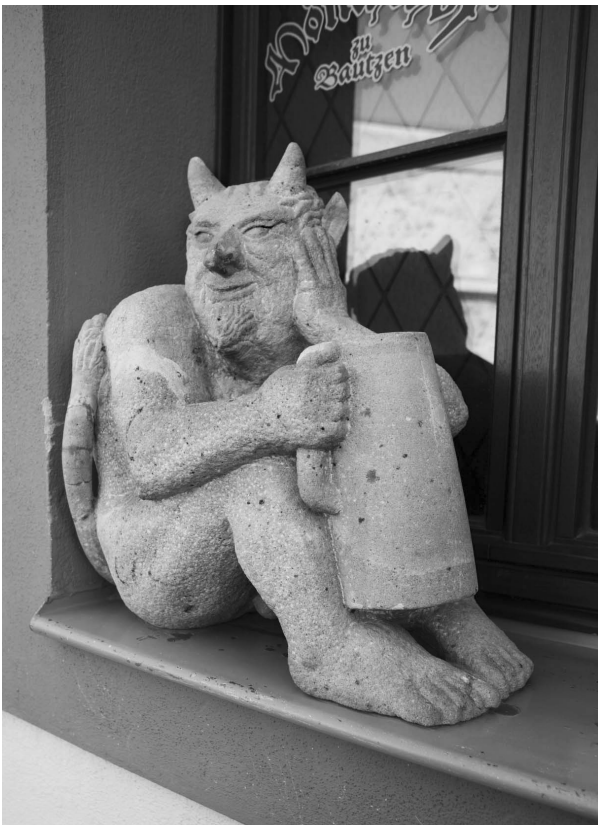
Bautzen, Germany