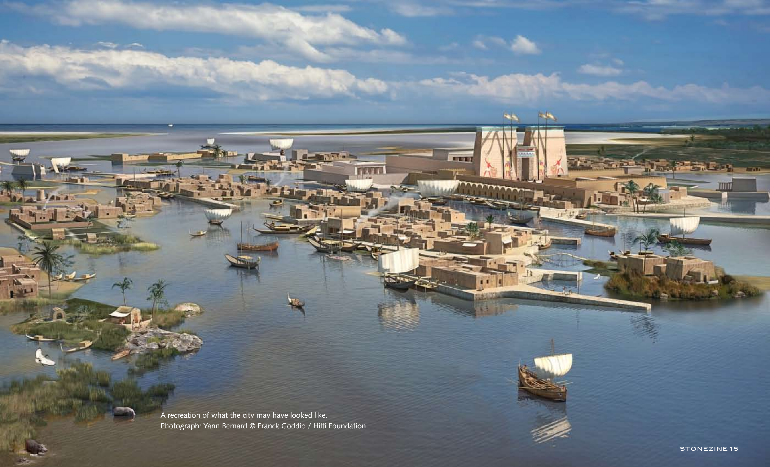
A recreation of what the city may have looked like.